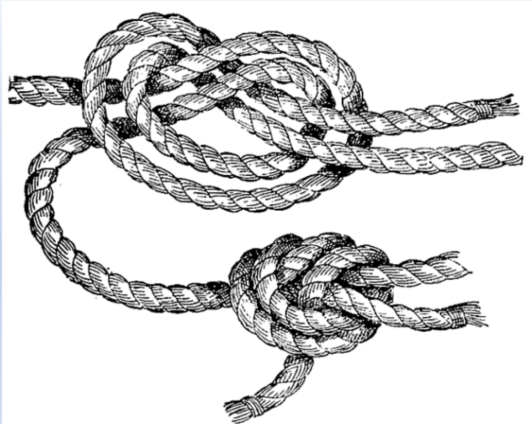
FIG. 16.—Open-hand knots.